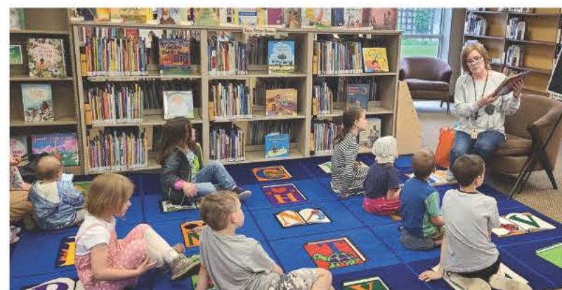
Pictured: Storytime in Waite Park