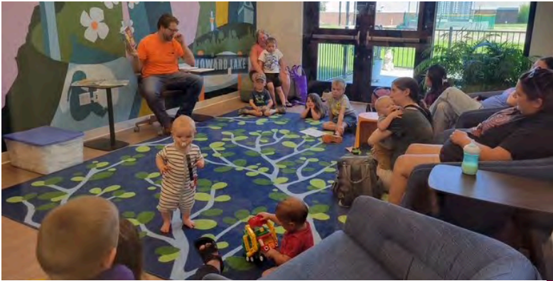
Pictured: Storytime in Howard Lake

The Summer Reading and Winter Reading Challenges were available to library users both in their local library and online through the Beanstack app.