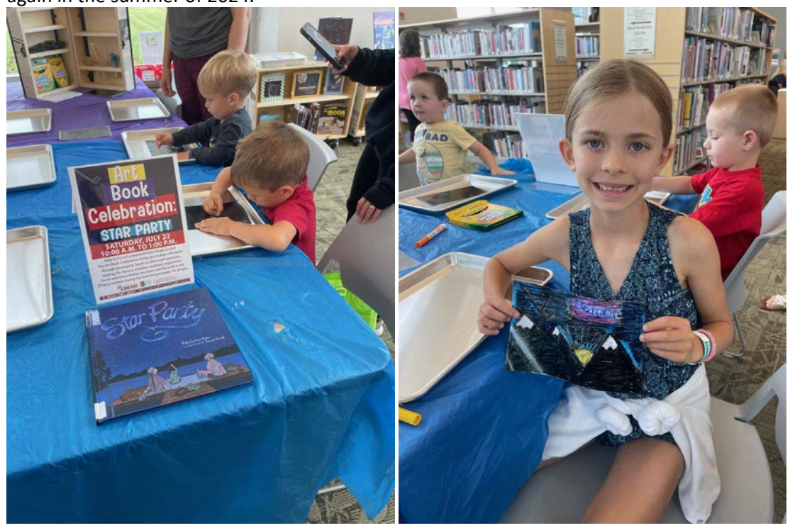
Children participate in the Art Book Circle test event at the St. Michael Public Library, summer 2023.

themes in books with hands-on projects and a deeper look at the artists' techniques and methods. Test events took place in the summer of 2023, with both The Collaboratory Outdoor Music Deck and Art Book Circle. Final events took place in the fall of 2023. A total of 116 attendees helped us try out Art Book Circle and 106 attended events for the Collaboratory Outdoor Music Deck. GRRL plans to work with both artists again in the summer of 2024.