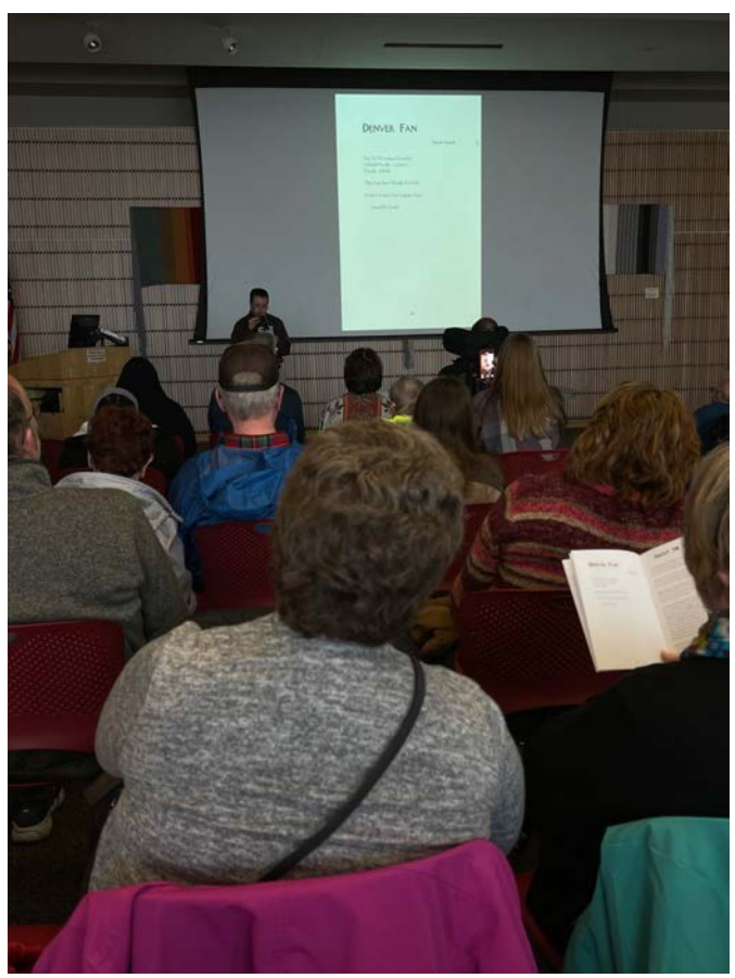
One of the writers reading his work at the Cow Tipping Press book launch event in summer 2023.