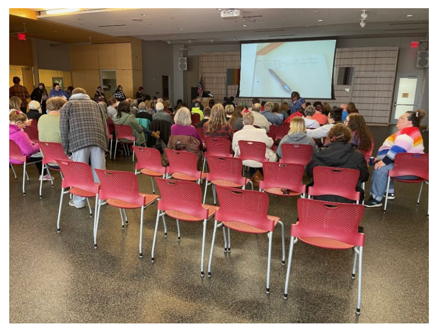
Full room for the Cow Tipping Press book launch event at the St. Cloud Public Library, summer 2023.

GRRL worked with Cow Tipping Press and local partner WACOSA to bring writing classes for individuals with intellectual and developmental disabilities to our region. Two writing class series took place at the St. Cloud Public Library in 2023, with about 10 students in each six-week long class, culminating in a final book launch event at the end of each series. Writers each got a cop y of their published work in the form of a book made by Cow Tipping Press, and copies are in the Great River Regional Library collection for checkout.