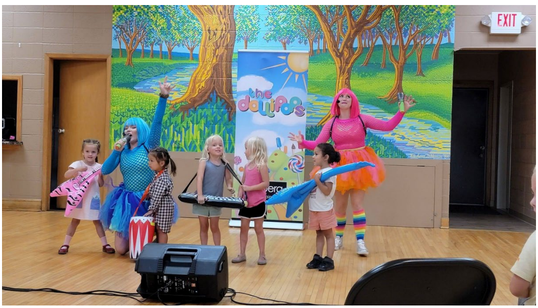
Children perform and sing along at the Dollipops concert for the Belgrade Public Library, summer 2023.

GRRL worked with Cow Tipping Press and local partner WACOSA to bring writing classes for individuals with intellectual and developmental disabilities to our region. Two writing class series took place at the St. Cloud Public Library in 2023, with about 10 students in each six-week long class, culminating in a final book launch event at the end of each series. Writers each got a cop y of their published work in the form of a book made by Cow Tipping Press, and copies are in the Great River Regional Library collection for checkout.