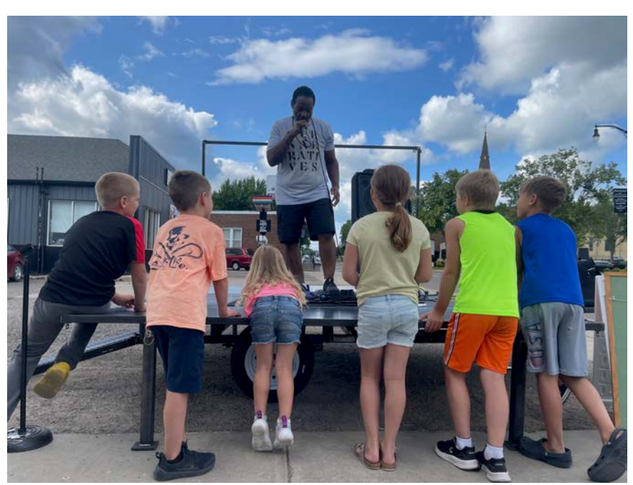
Participants at The Collaboratory Outdoor Music Deck at the Pierz Library, summer 2023.